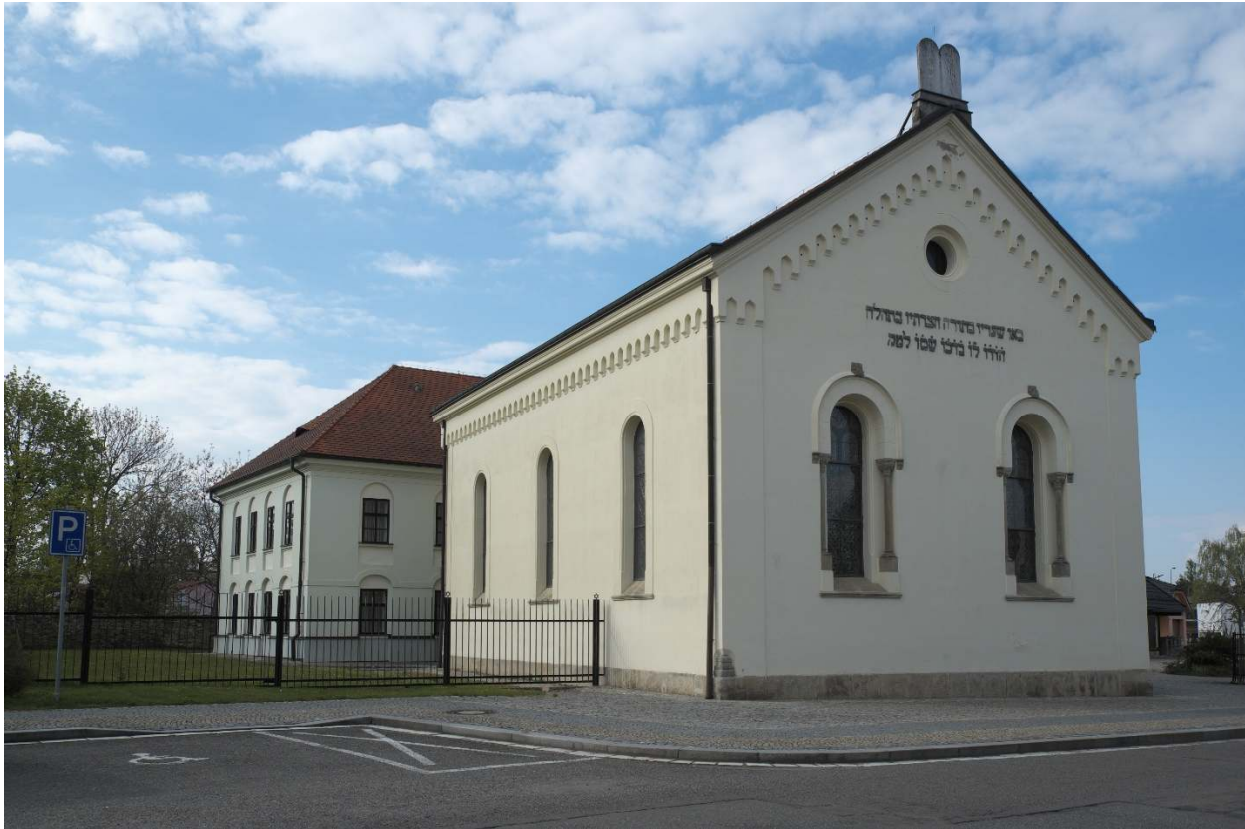
The synagogue in Hermanuv Mestec today

1870, again with the backing of the landowner. In 1848 the Habsburg Empire's restrictions on Jews were lifted, and a steady outflow of Jews ensued to Prague, other large cities in the empire, and abroad. In 1890 the Habsburg government decreed the merger of the dying Jewish communities in the region surrounding Hermanuv Mestec, and this was confirmed after the Czechoslovak state was formed, when the net was enlarged to include more dying or defunct communities in the region. The Hermanuv Mestec Jewish community, by virtue of its long established protected status in the law and with a rabbi in residence, came to serve about 500 Jews in the region even though the Hermanuv Mestec community itself had only about 60 Jews (15 families) on the eve of the German takeover.