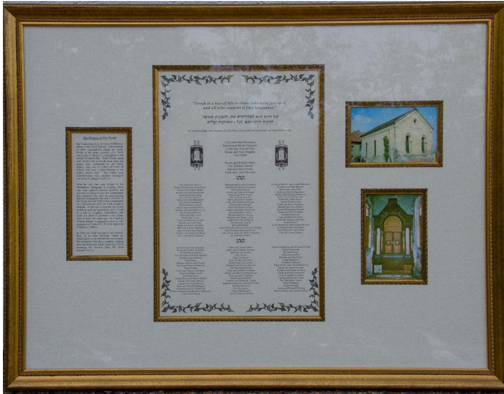
Plaque listing NVHC donors towards the restoration of the Hermanuv Mestec synagogue