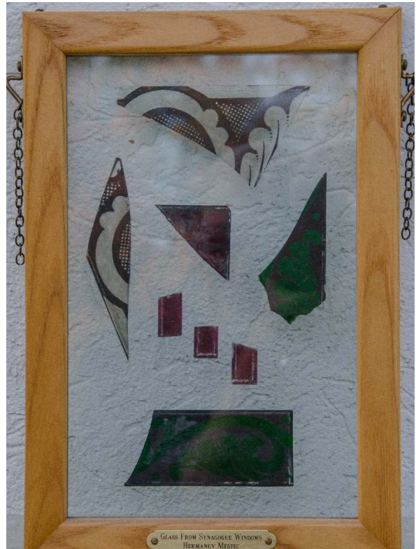
Fragments of stained glass from the Hermanuv Mestec synagogue, now hanging in NVHC lobby