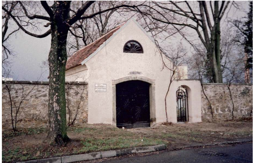
The Chevra Kadisha building (morgue) in Hermanuv Mestec

In 1940 the Germans closed the synagogue and banned organized Jewish life. Important community activities such as the Chevra Kadisha (burial society), Bikur Holim (society for visiting sick) and women's group were forbidden. In 1942, the community's Torah scrolls and other religious appurtenances were sent to the Jewish Museum in Prague, which served as the Germans' central collecting point.