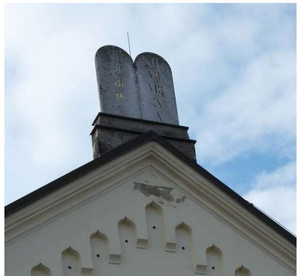
Ten Commandments