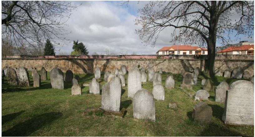
The Jewish Cemetery

Once the Jews were gone, the despoiled synagogue, stripped of its Judaica--though not its ark—was turned into a German Army warehouse. The rabbi's house, which served as the prayer meeting area except during the high holidays (on the eve of the war the community barely exceeded a minyan), became public housing. The cemetery, after more than 500 years one of the largest in Bohemia with