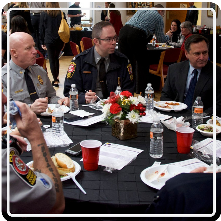
NVHC was honored to host the First Responder's Luncheon for local police officers, firemen, EMS teams, and other first responders.