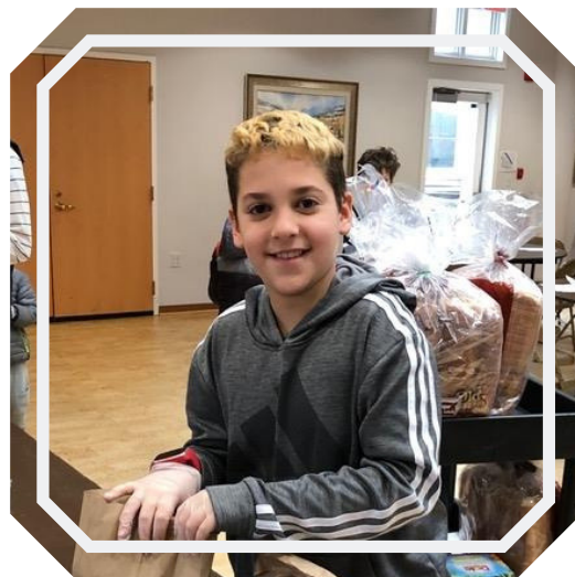
A religious school student packs meals for Shelter House

100 people at Cornerstones' Embry Rucker Shelter in observance of Good Deeds Day, a global effort supported by our local Jewish Federation. Interested in helping? Watch for links to sign up in the weekly NVHC eblast.